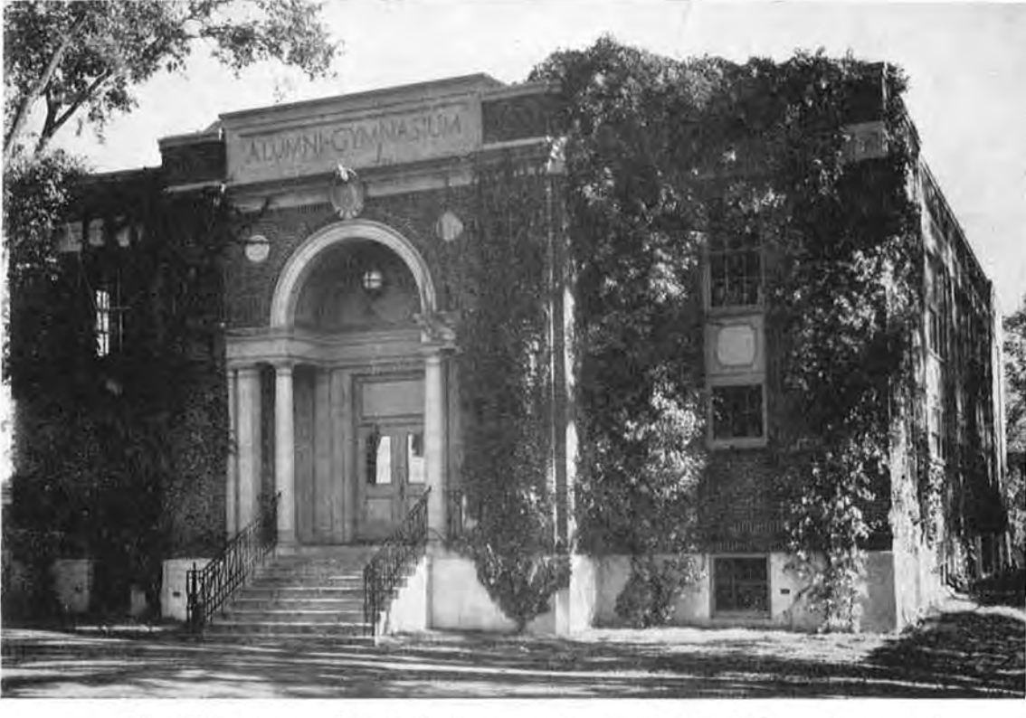
The Alumni gymnasium, built in 1931, offers modern facilities for the physical education program and competitive sports.