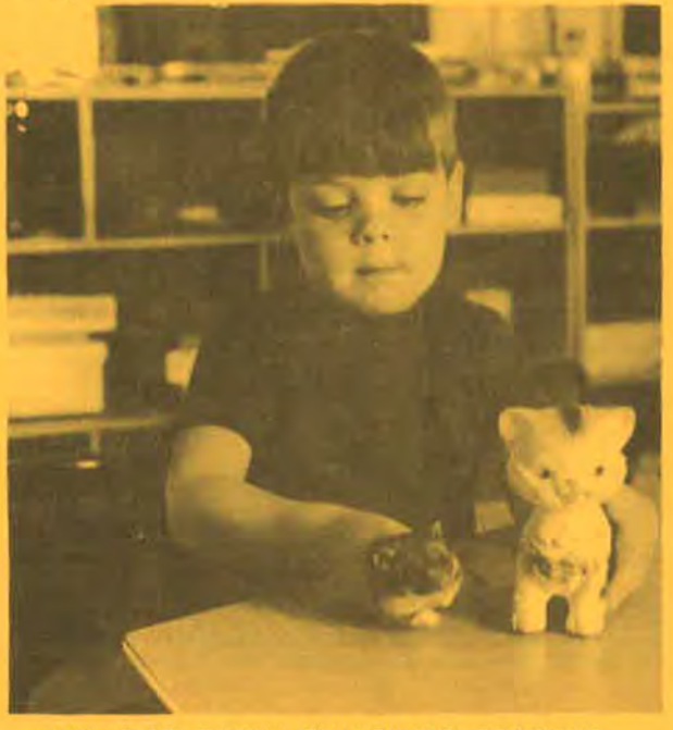
TWO YEAR EARLY CHILDHOOD PROGRAM

The two year program in Early Childhood Education is designed to prepare students to work as aides or assistants in day care centers, public schools, private nursery schools and head start programs, or to provide licensed care for children in private homes.